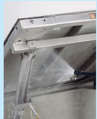
The EZ-CLEAN scale tilts up 45 degrees to expose the underside and pit for washdown.