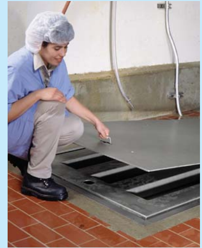
The EZ-LIFT scale has gas-pressurized struts that make it easy to lift the platform for cleaning.

Fixed lower receiver helps keep rocker pin in ideal weighing position. Never needs adjustment.