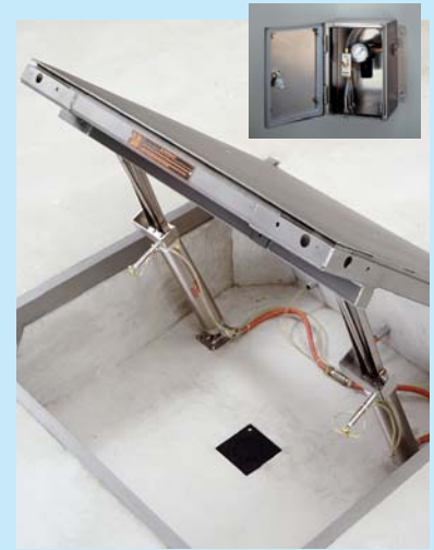
Pneumatic control and cylinders automatically lift the EZ-CLEAN scale for cleaning.